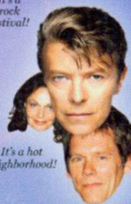
It's a hot neighborhood!