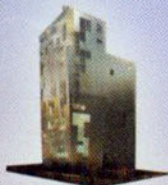
It's a developer's dream!