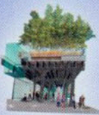
It's a design mecca!