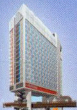
It's a tourist attraction!